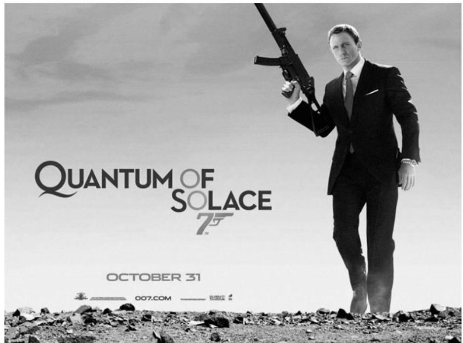
We did like this Teaser Poster for Quantum of Solace (2008)